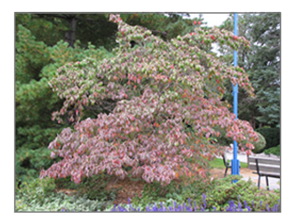
Chinese Dogwood in fall

This tree does best in full sun to partial shade. It does best in average to evenly moist conditions, but will not tolerate standing water. It is very fussy about its soil conditions and must have rich, acidic soils to ensure success, and is subject to chlorosis (yellowing) of the foliage in alkaline soils. It is somewhat tolerant of urban pollution, and will benefit from being planted in a relatively sheltered location. Consider applying a thick mulch around the root zone in winter to protect it in exposed locations or colder microclimates. This species is not originally from North America.