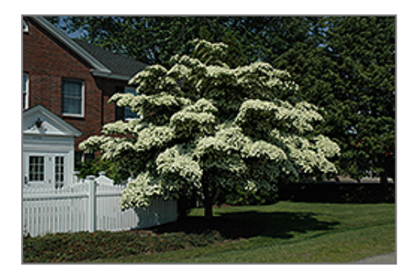
Chinese Dogwood in bloom

This is a relatively low maintenance tree, and should only be pruned after flowering to avoid removing any of the current season's flowers. It is a good choice for attracting birds to your yard. It has no significant negative characteristics.