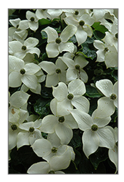
Chinese Dogwood flowers